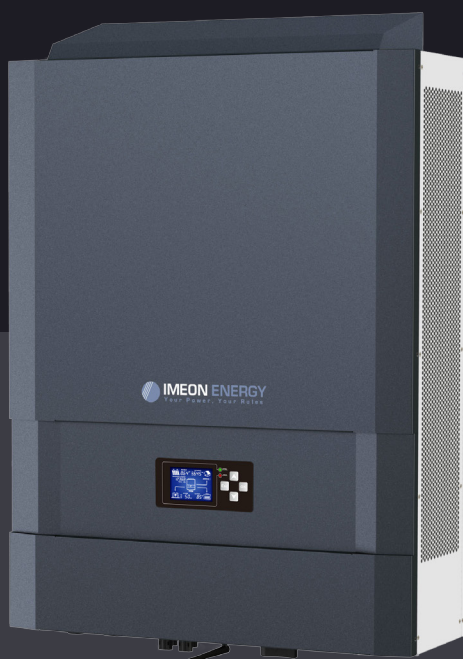
IMEON 9.12 Up to 12kWp Three phase