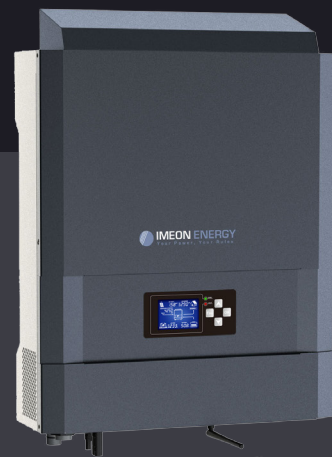
IMEON 3.6 Up to 4kWp Single phase